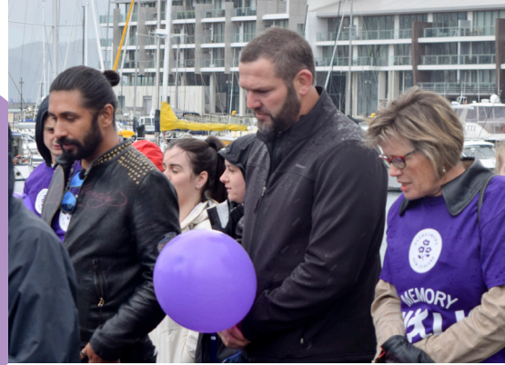
The three Champions for Dementia - Wellington