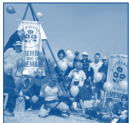
Mt Kilimanjaro Summit-World Team