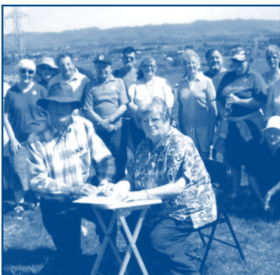
Alzheimer's Gisbourne Hill Climb