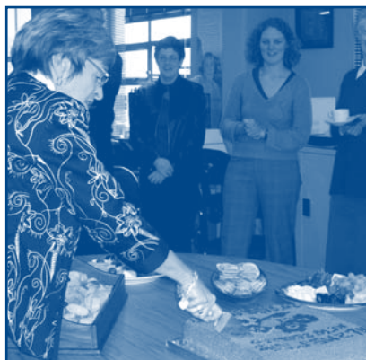
National Office Cuppa